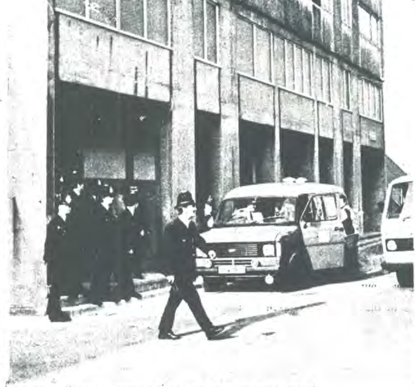
rants for stolen goods allegedly The boys in blue - coming soon to your neighbourhood?

Maire O'Shea Support Committee c/o 448 Stratford Rd Birmingham 11 tel: 021-773 8683