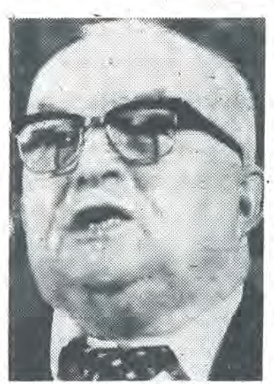
Death mask of Trotskyism?

He clearly never had a clue about workers' democracy in the Leninist Party. He achieved his monstrous prominence by ousting all the main leaders of post-war Frotskyism except himself. In the fifties and sixties he built his organisation, the SLL, on the basis