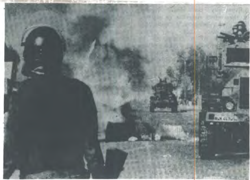
South African security forces on the rampage

It is the working class, in Europe and the USA but most of all in Britain whose urgent duty is to come to the aid of the black brothers' and sisters' struggle against this inhuman regime. The Anti-Apartheid Demonstration of 2nd November was a massive show of solidarity, in particular from students and working class youth. But on their own, demonstrations, even demonstrations which end in pitched battles outside South Africa House, will not decisively help the fight against Apartheid. A massive movement of solidarity action needs to be built in Britain now. But