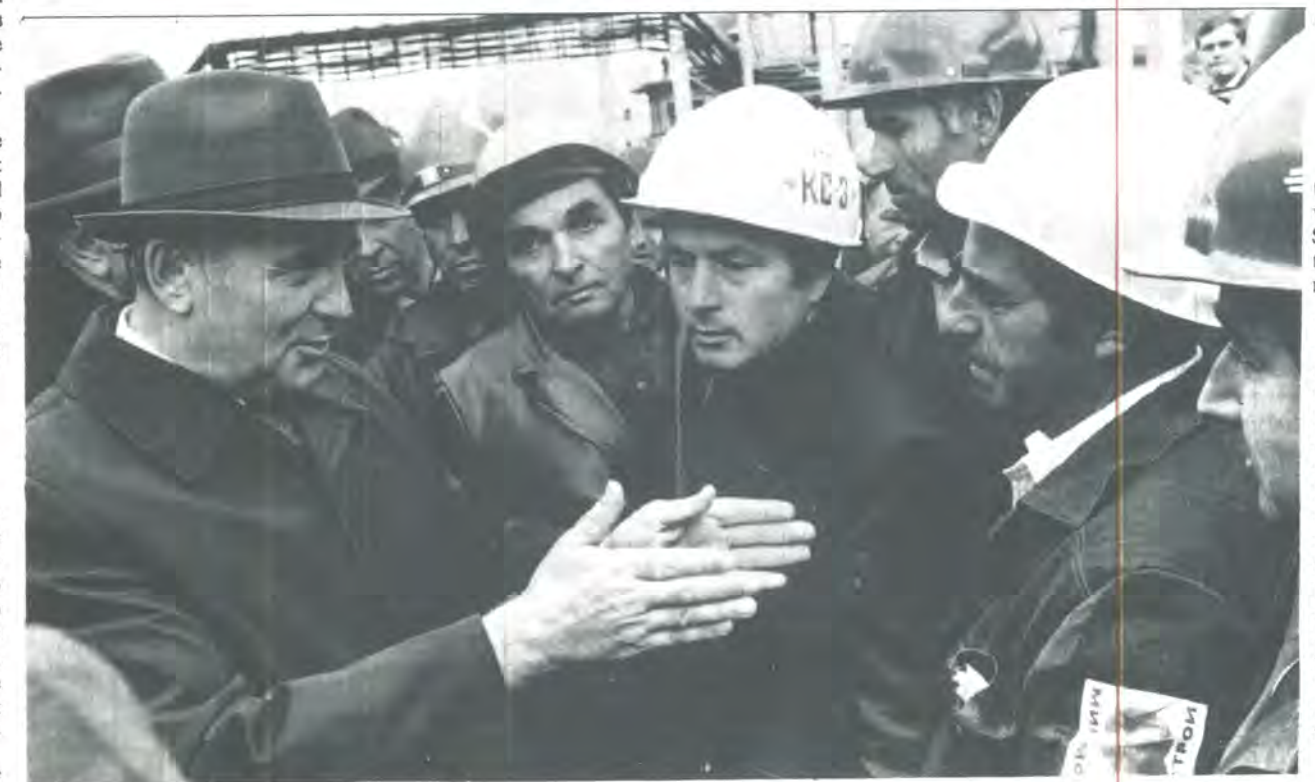
New leader - same story - work harder

to blind ourselves or our fellow workers to the crimes of the Soviet bureaucracy. While defending the USSR against imperialism we must also combat every rotten deal it strikes with the imperialists at the expense of the working class or the struggle for national independence. We must combat its privileged misrule over Soviet society which is maintained only at the expense of the wholesale repression of the USSR's working class and squandering of much of the potential of a planned noncapitalist economy. We must sup-port all working class struggles against their bureaucratic masters. But our opposition to bureaucratic rule must not, in turn, blind us to the need to stand four-square with the USSR against Reagan's war drive.